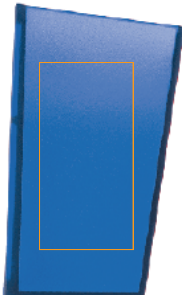
3. AT THE SIDE