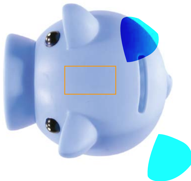
2. TOP SIDE