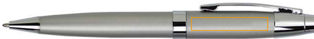
1. NEAR CLIP RIGHT HANDED