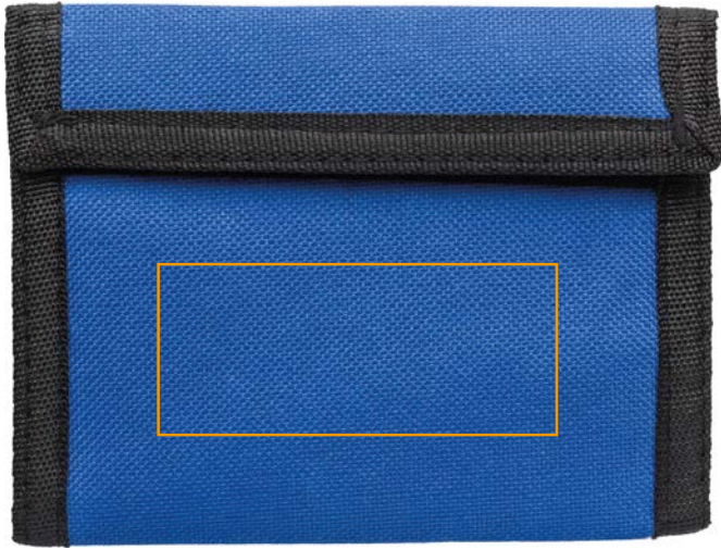
1,2,3. FRONT SIDE