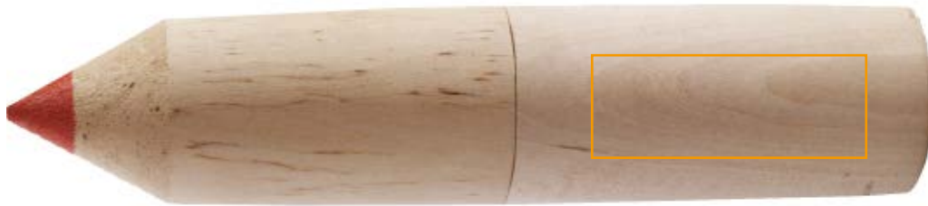
1 + 3. HOLDER