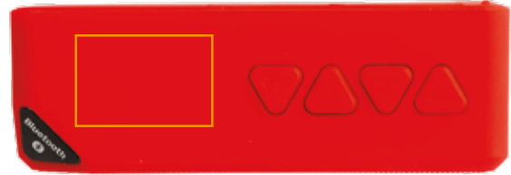
2. TOP SIDE