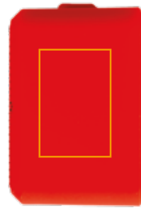
4. RIGHT SIDE