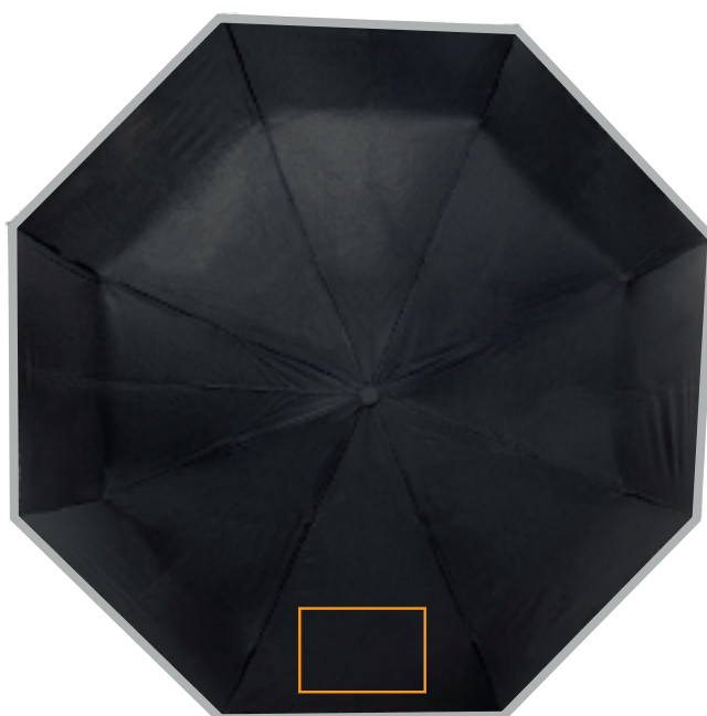
1 + 2. PANEL 1