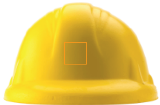
4. FRONT SIDE