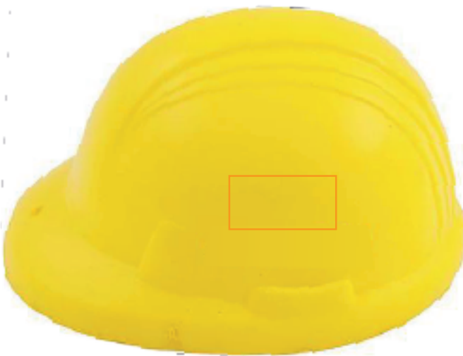
3. AT THE SIDE